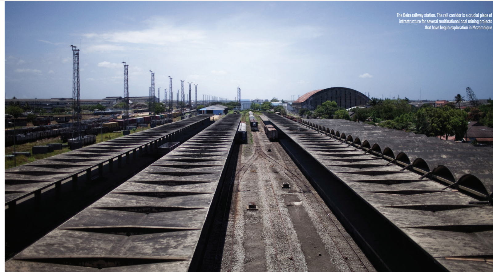
The Beira railway station. The rail corridor is a crucial piece of infrastructure for several multinational coal mining projects that have begun exploration in Mozambique

Government is starting to embrace this truth and is creating policy frameworks that encourage private sector participation across both disciplines. What is also very positive is the government's resolve to see local beneficiation of its resources to create jobs, stimulate economic growth and deliver tangible benefits to the country's citizens. This contributes to creating a positive investment climate that is bound to attract capital from international sources.