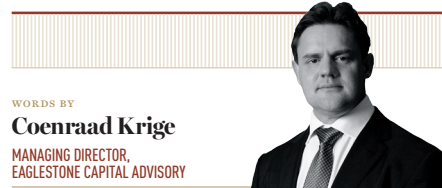
WORDS BY Coenraad Krige MANAGING DIRECTOR, EAGLESTONE CAPITAL ADVISORY

Mozambique is entering an era of unprecedented economic growth spurred on by natural resources development and increased infrastructure delivery