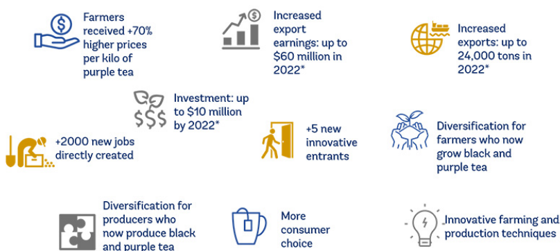
Figure 2: creating markets – Kenya purple tea impact

*WBG estimate based on Kenya Tea Development Board projections